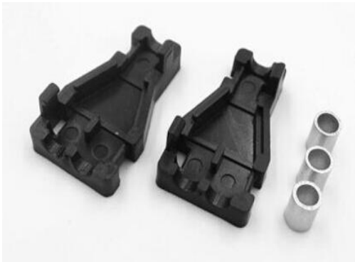
Armored cable 3.0mm fanout