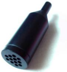
MPO 12C bundle fanout kit 2.0mm