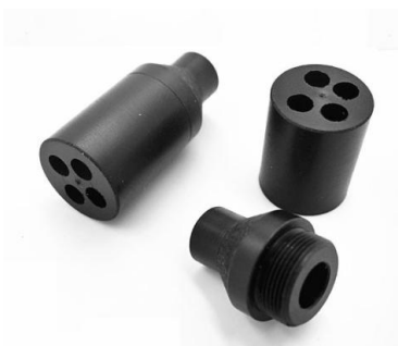
4C Bundle 2.0mm fanout kit