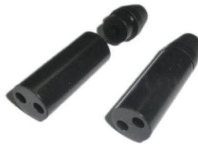
2C 3.0MM fanout kit