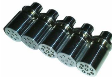
Meta version 8 fiber fanout kit