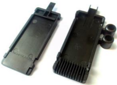
12C Ribbon kit 2.0mm fanout kit