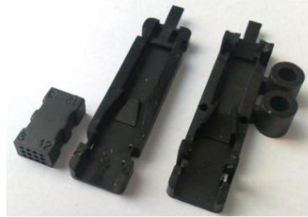
Ribbon 12C fanout kit 0.9mm